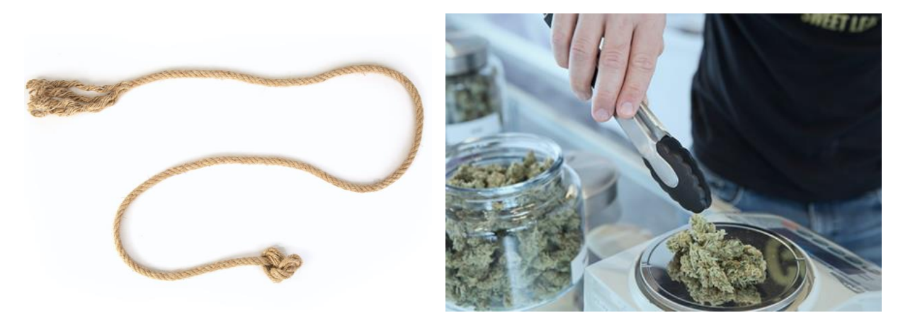
Hemp can be manufactured into products, like rope (pictured left). Marijuana is harvested and/or manufactured for medical and adult-use consumption due to its psychoactive properties (pictured right).