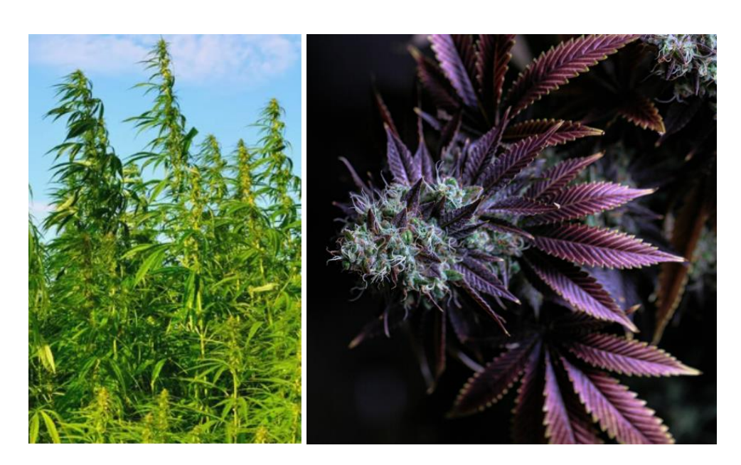
Industrial hemp is pictured on the left, while marijuana is pictured on the right.