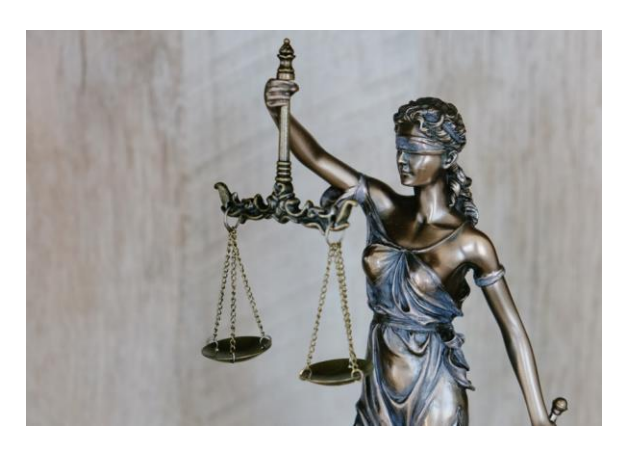
Industrial hemp is legal to cultivate anywhere in the United States. Only some states allow marijuana to be cultivated for medical and/or adult-use consumption. Marijuana remains illegal at the federal level.