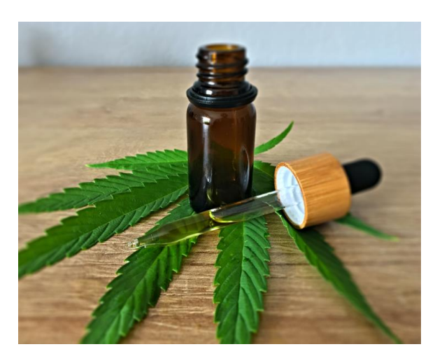
CBD is present in both hemp and marijuana.