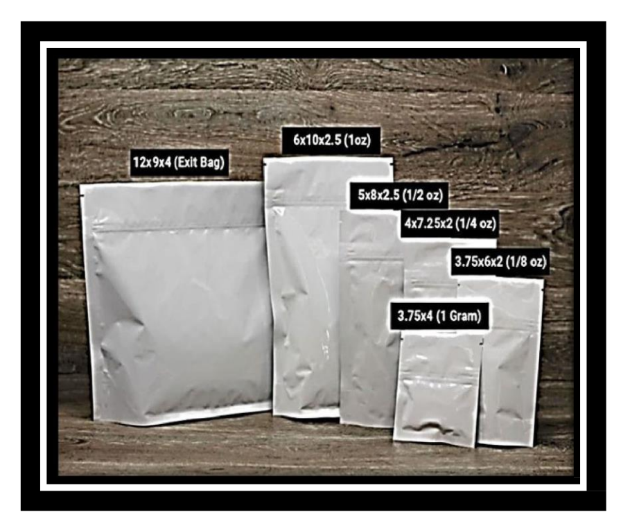
EXIT PACKAGE SAMPLES