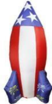
Examples of prohibited decorations, left to right: an inflatable Santa, a Jack-o'-lantern, a neon sign, and an inflatable 4 th of July decoration.