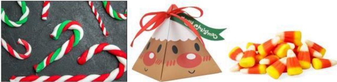
Examples of prohibited products and packaging, left to right: infused candy canes, Christmas packaging attractive to minors, and infused candy corn.